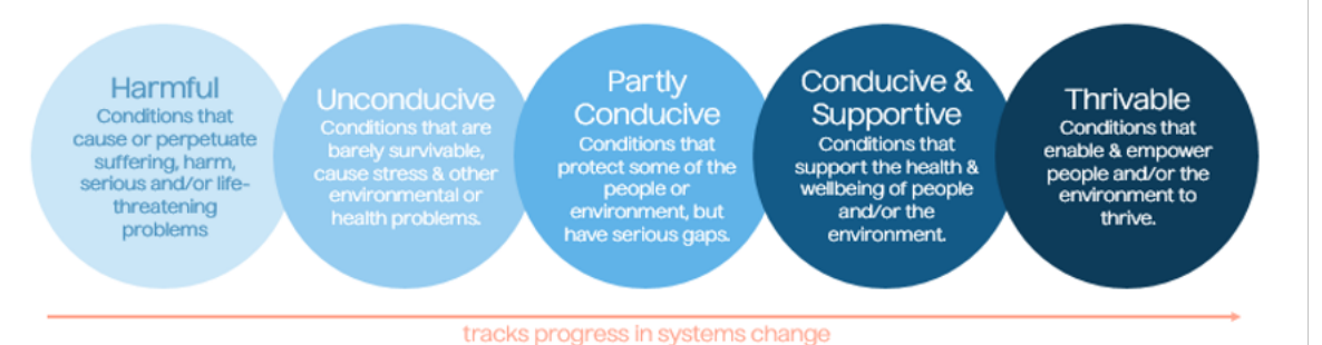
Image: Laudes Foundation Rubrics Rating Scale

Each rubric is designed to be assessed on a rating scale from 'harmful' to 'thrivable'. The full documentation of the rubrics (Laudes Foundation 2021) describes each rubric in detail, and defines the ratings<sup>8</sup>.